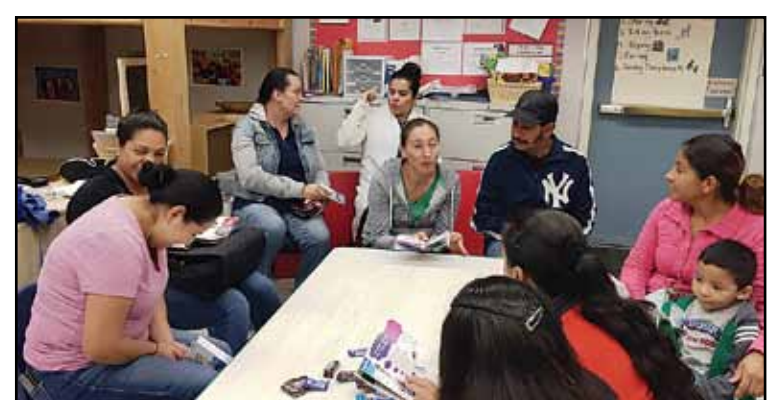
children. Families received a gift book at the end of the workshop to add to their home libraries.