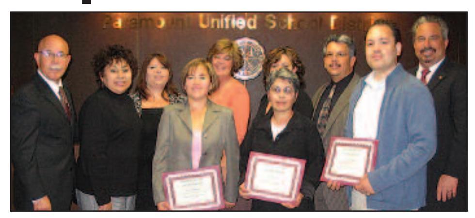
The Board of Education and Superintendent presented a certificate to the counselors at Paramount High School to recognize their work in earning the College Board's Inspiration Award.

The College Board is a national organization whose mission is to support high schools in their work to increase the number of students who leave high school ready to enter college. Each year the College Board invites high schools to apply for its Inspiration Award, which recognizes schools that make significant progress in increasing the number of students who are academically prepared for college. After reviewing applications in which each school was required to show data that demonstrated how it increased the number of students preparing for and entering college, the College Board select-