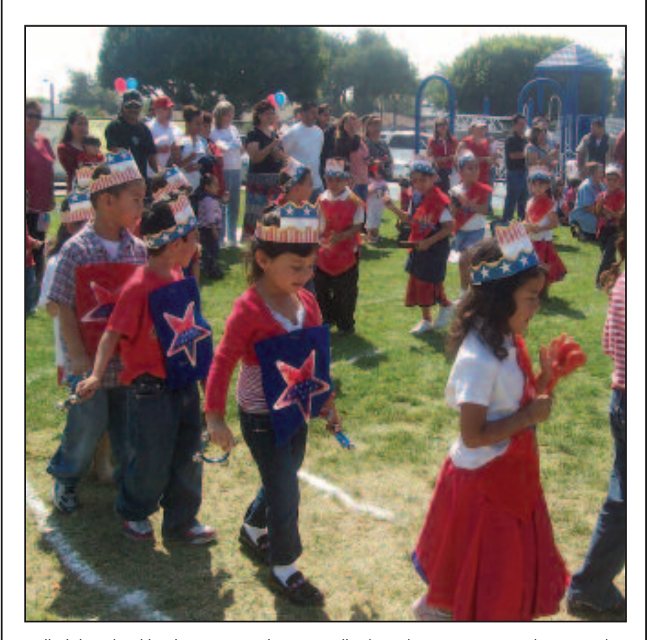
Hollydale School kindergarten students proudly show their patriotism in their parade.

The kindergarten students at Hollydale School have been learning about the United States of America. Throughout their unit, titled "Red White & Blue", the students have examined ways to show patriotism, learned about national symbols and holidays, and gained an understanding of what it means to be a good citizen.